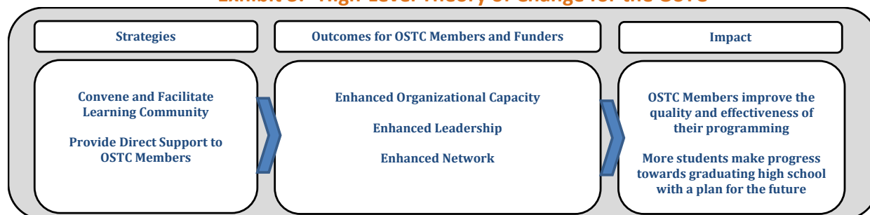
Exhibit 3. High-Level Theory of Change for the OSTC

LFA also developed a more detailed logic model and an evaluation plan based on the Theory of Change (See appendices E and F). In addition to these frameworks, the following core questions guided the evaluation: